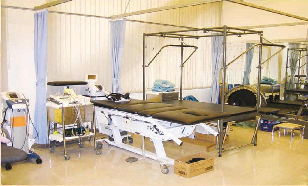
The Physiotherapy Clinic 物理治療診所