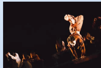
Coven by Mickael 'Marso' Riviere 江華峰《聚》