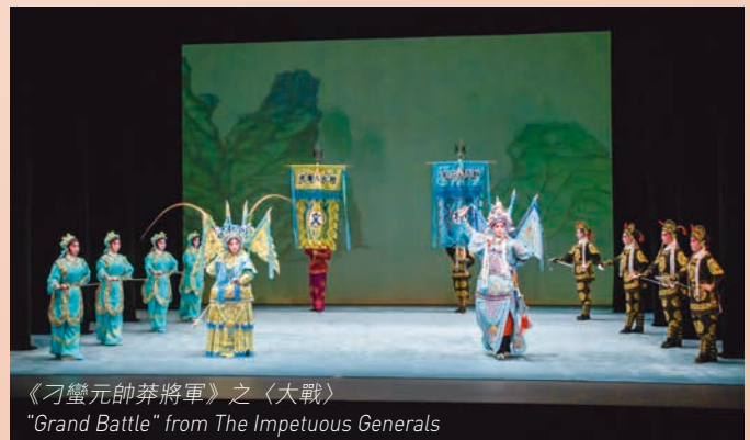
《刁蠻元帥莽將軍》之〈大戰〉 "Grand Battle" from The Impetuous Generals

一年全日制課程旨在為學員提供穩固的戲曲基礎訓練，為進一步的研習奠下紮實基礎。基礎粵劇文憑課程提供表演及音樂兩項主修。