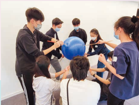
Academy ICAC Ambassadors joined the ICAC training camp with ambassadors from other tertiary institutes to develop their leadership skills and team working spirits. 演藝廉政大使與其他大專院校的廉政大使一起參與訓練營，建立領導技巧及團隊精神。

職業指導服務協助學生探討個人職業取向，以計劃畢業後的事業發展。學院亦會提供不同的職前培訓，教導準畢業生撰寫求職信和履歷以及面試技巧。