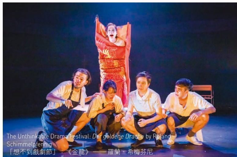
The Unthinkable Drama Festival: Der goldene Drache by Roland Schimmelpfennig 「想不到戲劇節」：《金龍》——羅蘭·希梅芬尼

報讀藝術學士課程的申請非常踴躍，競爭激烈。對表演藝術有興趣的人士均歡迎報讀。報讀應用劇場系、導演系及劇場構作系的考生如已取得其他學士資格，將獲優先考慮。