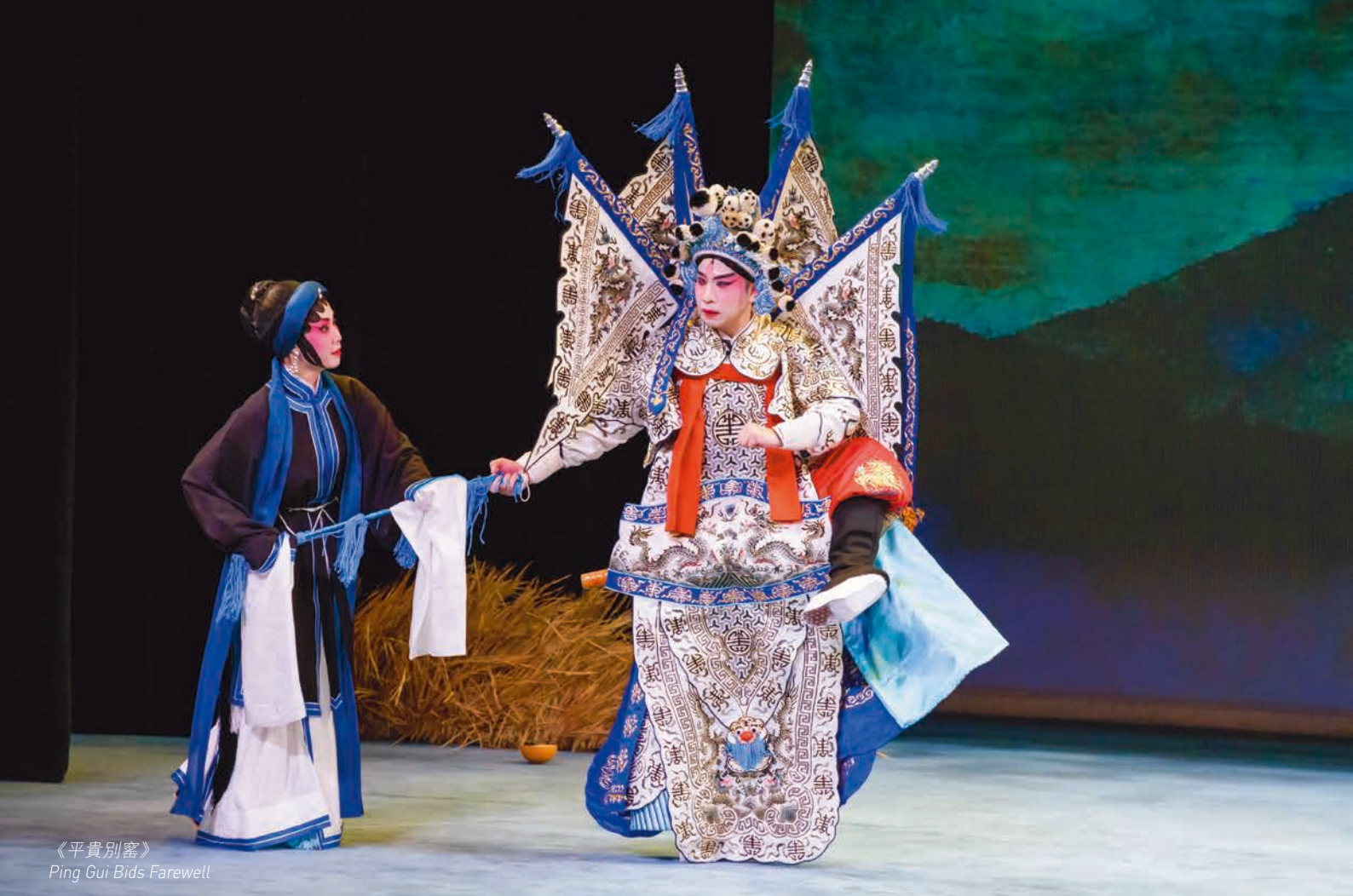
《平貴別窰》 Ping Gui Bids Farewell