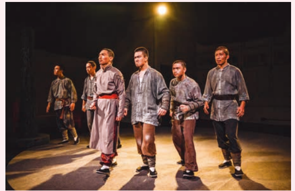
Ng Wong the Swordsman 《大刀王五》

Drama is at the very heart of human expression, its communication and identity. The School of Drama believes that its unique position in Asia offers an insight into this artform that will both inform and develop significant creativity and distinctive artists to engage with and feed the cultural community of Hong Kong, the Mainland and beyond. The School of Drama strives to be an incubator, catalyst and repository of the values and importance of the dramatic and performative arts and expresses this in the nurturing of actors, directors, playwrights, dramaturgs and teachers who will function as practitioner-artists making a tangible difference to their community and their chosen discipline.