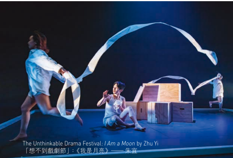
The Unthinkable Drama Festival: I Am a Moon by Zhu Yi 「想不到戲劇節」：《我是月亮》——朱宜