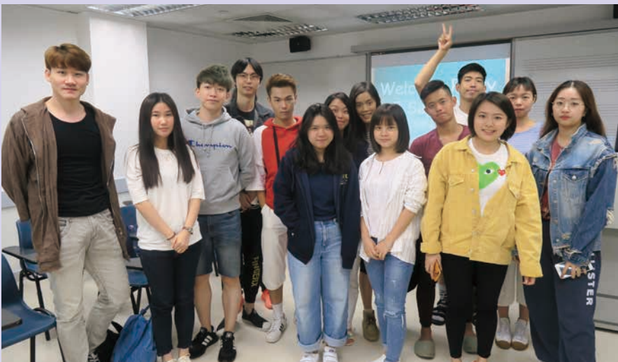
Gatherings for newly arrived non-local students and their buddy mentors 非本地新生及師友參與活動