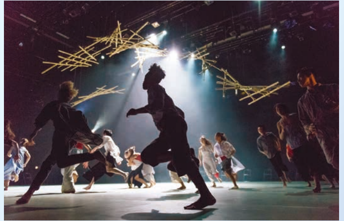
Three Fingers at Arm's Length by Leila McMillan (Photo by Felix Chan) 麥麗娜《Three Fingers at Arm's Length》(陳振雄攝影)