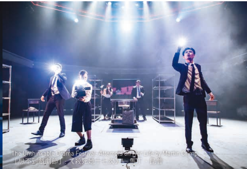
The Unthinkable Drama Festival: Attempts on Her Life by Martin Crimp 「想不到戲劇節」：《殺死她十七次》——馬丁·昆普