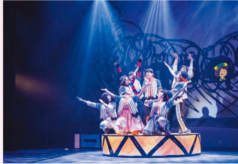
Musical : You're A Good Man, Charlie Brown 音樂劇：《最好先生 Charlie Brown》

戲劇畢業生的工作機會十分專業化和多樣化，部分畢業生加入本地戲劇團體或電視台，如香港話劇團、中英劇團、無綫電視、有線電視及 ViuTV 等。有些以自由工作者形式參與電影、電視和新媒體創作，或創立自己的新劇團。有部分學生則參與和表演藝術有關的教學及行政工作等。