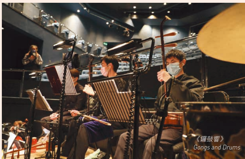
《鑼鼓響》 Gongs and Drums

學員畢業後可受僱於香港不同的粵劇團體，亦可自組粵劇團或以自由工作者身分擔任演員、伴奏樂師、粵劇/粵曲導師、編劇、評論、研究員或參與不同的創意專業。政府會堂及文娛中心亦常聘用對粵劇有認識的行政及管理人員。畢業生亦可從事粵劇教育及推廣工作。