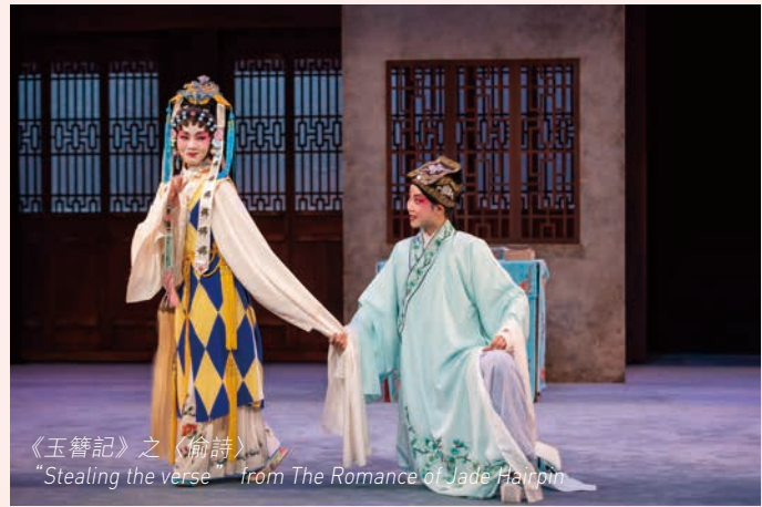
《玉簪記》之〈偷詩〉 "Stealing the verse" from The Romance of Jade Hairpin

戲曲藝術學士(榮譽)學位課程提供表演及音樂兩項主修。旨在發展學生之學術及智能達至學歷架構第五級及專業水平之戲曲表演技巧。課程亦重視發展學生之藝術創意和獨立性和對戲曲與其他學科和藝術相互關係之認識，以鼓勵學生擴展知識層面。學生學習戲曲之審美及發掘傳統創作過程之新應用。課程的畢業生將會是有效推動戲曲藝術的專門人才。